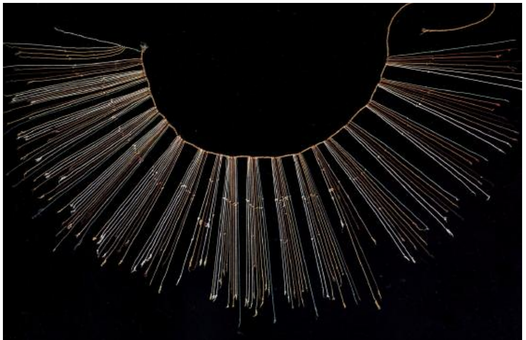
Figure 1: The 'kipu': an Inca-era example of the undeciphered Andean record-keeping (and narrative?) system.

Yet while each of the disciplines of prehistory opens up its own partial window on the past, frustratingly their different perspectives do not yet converge into a coherent, focused vision. On the contrary, specialists in each field have all too long proceeded largely in ignorance of great strides being taken in the others. The prospects are all the brighter, then, for a spectacular advance in our understanding, if we can at last weave all these disparate stories together. Indeed, the Andes prove a valuable case-study for how one might achieve a more holistic view of prehistory in other regions of the world too. The task is all the more urgent here, as both our archaeological and linguistic records are progressively and irrecoverably destroyed: by 'grave-looting' to supply the market in illicit antiquities; and by the inexorable, imminent extinction of almost all indigenous languages.