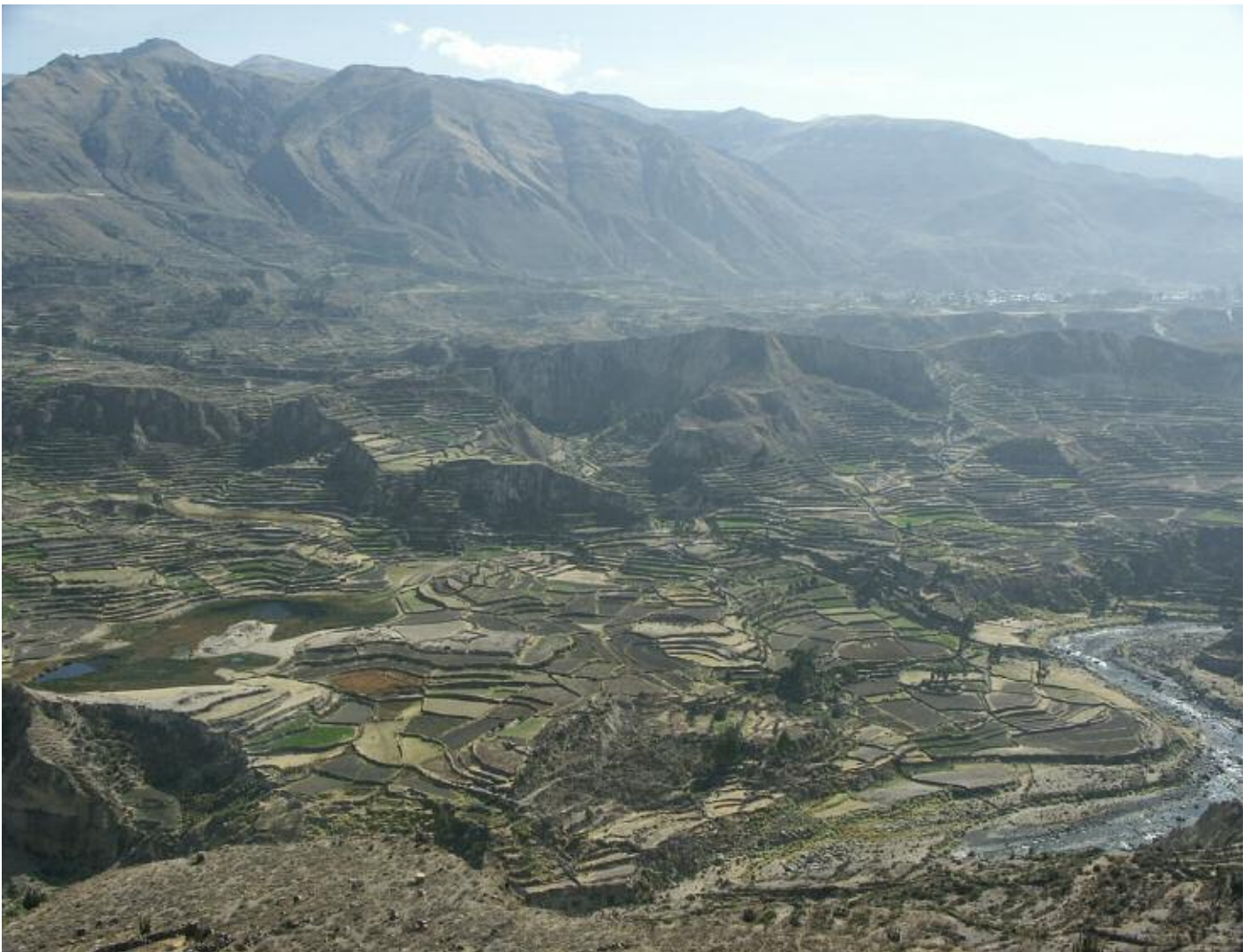
Figure 5: Colca, south Peru. Vast arrays of terracing have defined the agricultural landscape of the Andes for millennia.