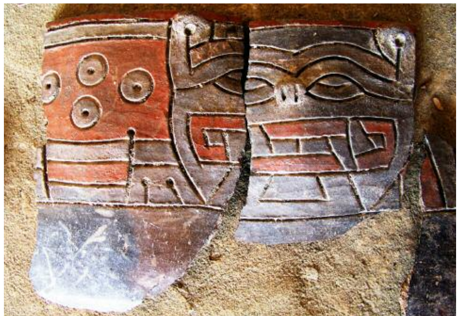
Figure 3: A 'Chavinoid' feline from excavations in 2007 funded by the British Academy in Ullujaya, Ica: 600 km south of the Chavin homeland, at the far frontier of the Early Horizon – perhaps also the age of the first major language expansion in the Andes.

In chronology, however, it seems clear from the relative strength of the two families that an earlier, now weaker Aymara spread came first, followed more recently by a more powerful Quechua overlay. This logic points, then, to Chavín as the homeland of Aymara, with the Early Horizon to propel its dispersal; while Quechua's origins would lie near Ayacucho, whence it expanded in concert with the Wari Empire during the Middle Horizon (Figure 4). This new vision entirely overturns traditional proposals (as well as calling for an entirely new classification of